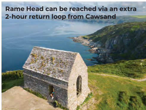
Rame Head, Cornwall

Rame Head can be reached via an extra 2-hour return loop from Cawsand