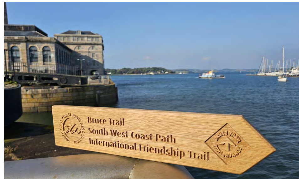
Photograph: Friendship Trail sign by Lorna Sherriff

there are more toilets and refreshments. Stay to the lower side of the field and at the end of the grass, from the stone "doormat" to Plymouth, use the renovated steps down and stairs up again to access woodland. The Path then undulates and emerges above Fort Bovisand; there are refreshments here. Cross the car park and follow the Path down to Bovisand beach, then up to the chalet park road; follow round to the right to pass seaward of the chalets, past a cafe and toilets and on round the point and so to Heybrook Bay. There is a pub a little way up the road here, as well as a bus stop. Keep right and follow the Path above the shore around Wembury Point and on to Wembury Beach. Yet more toilets and refreshments await here, and the bus stop, together with pub and shop, are in the village a little way inland.