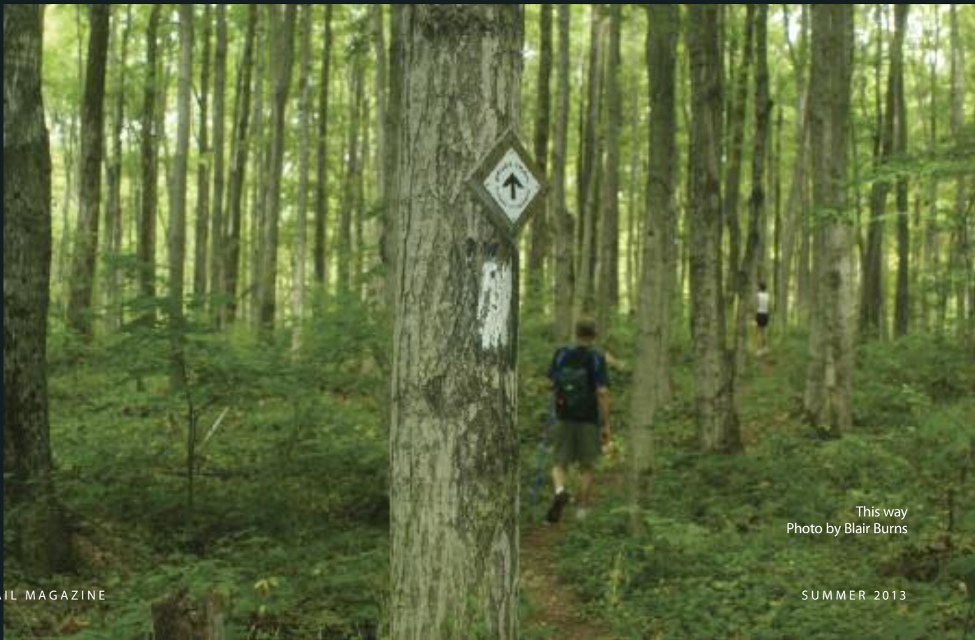
This way