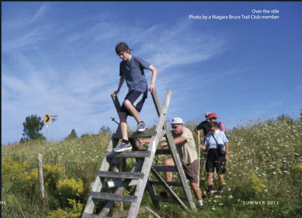
Over the stile