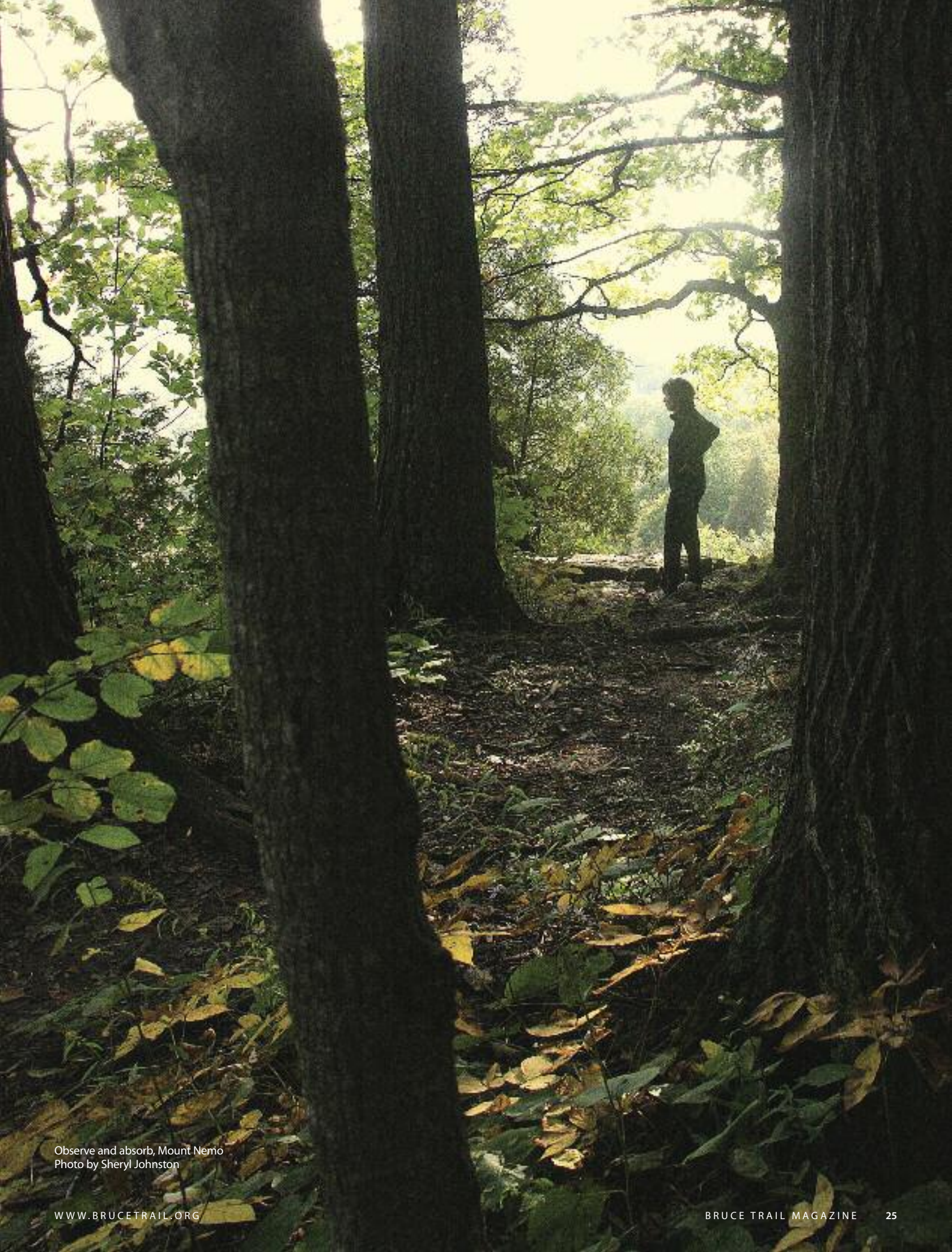
Observe and absorb, Mount Nemo