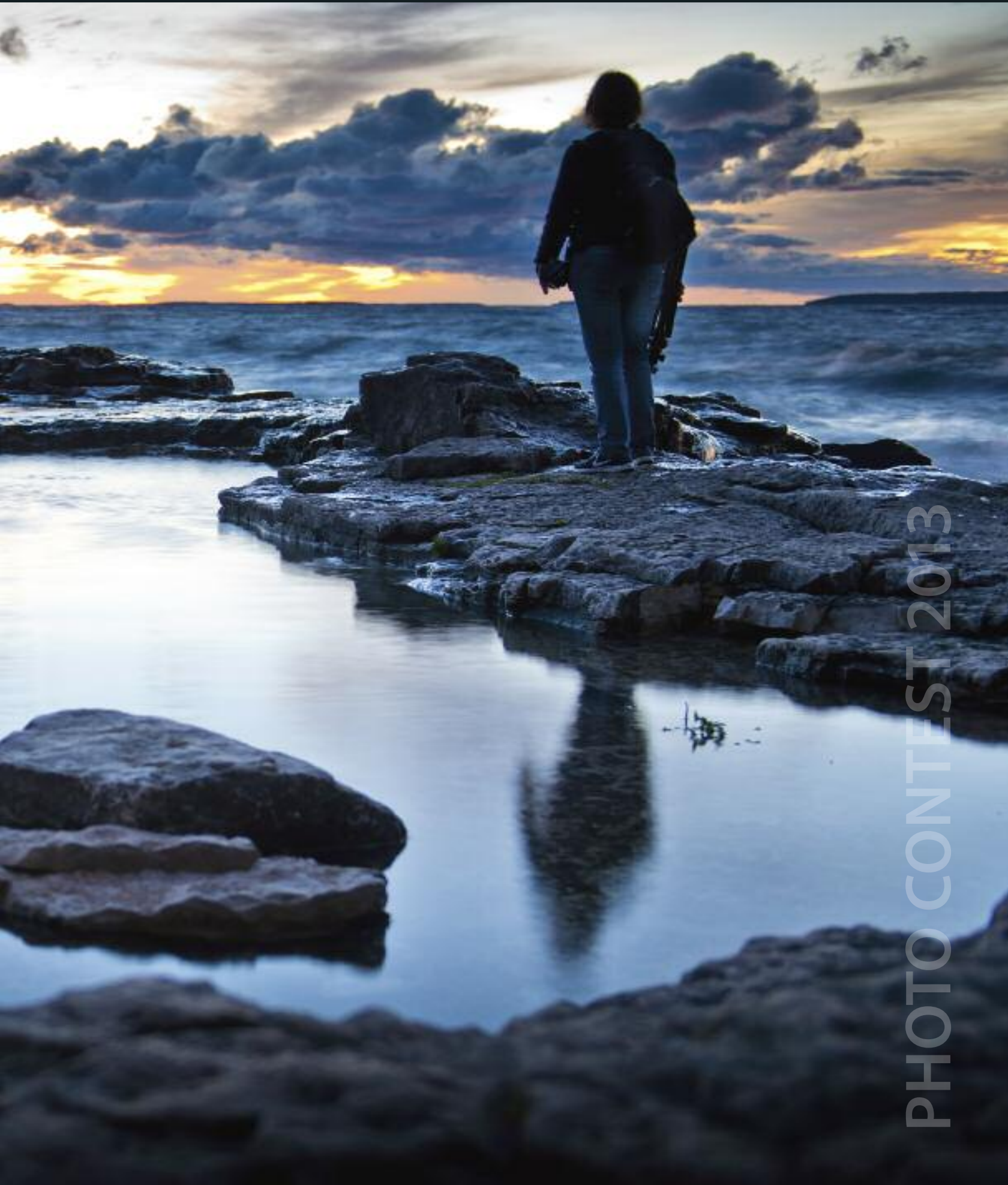
PHOTO CONTEST 2013