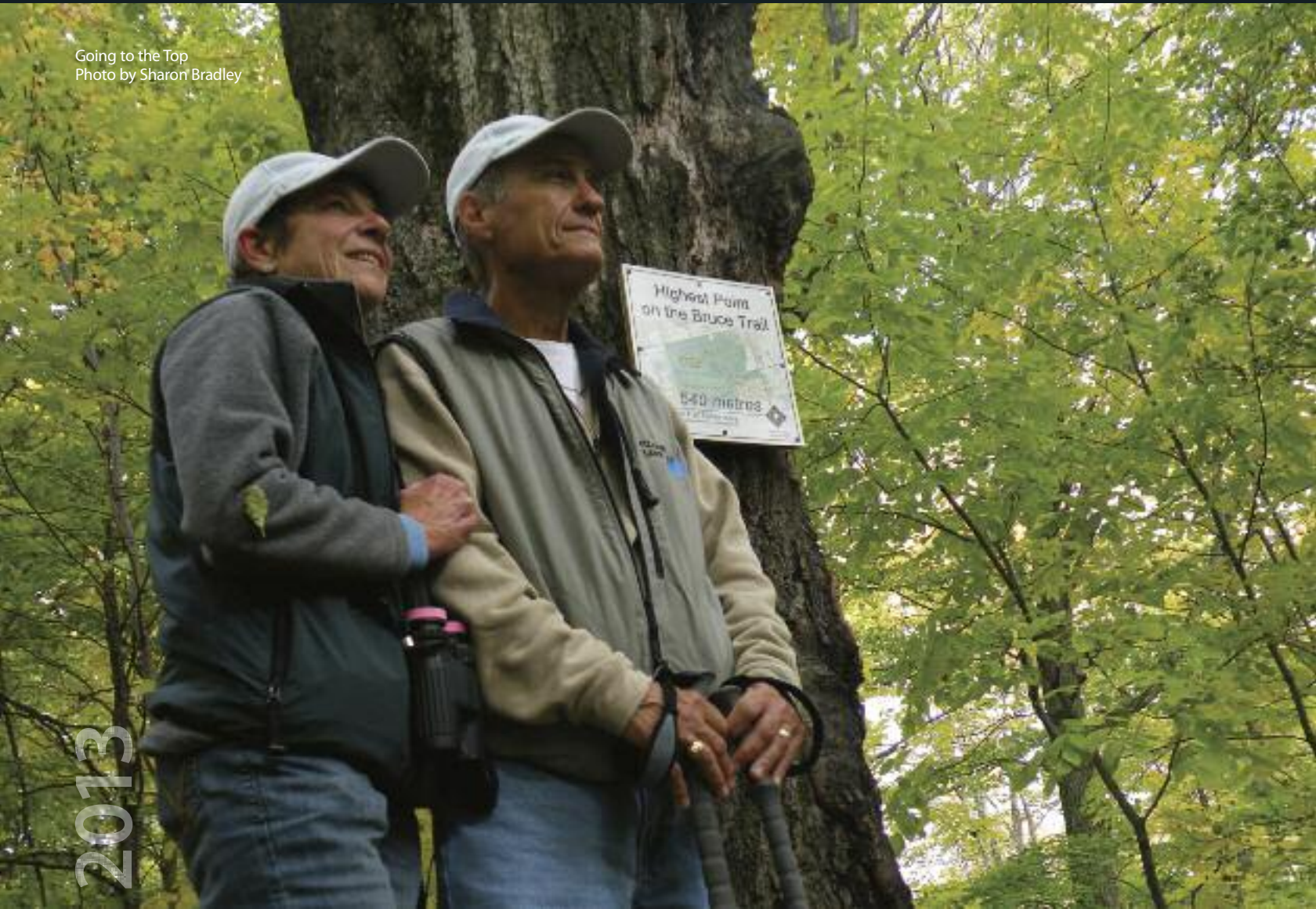
Going to the Top