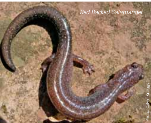
Red Backed Salamander