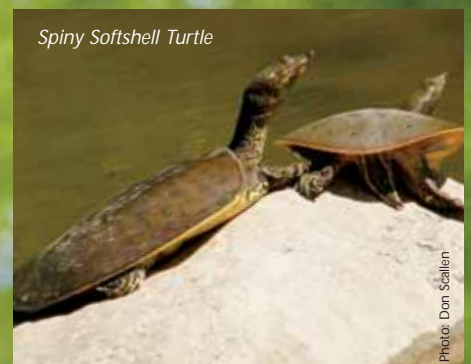
Spiny Softshell Turtle

For anyone fortunate enough to be hiking the Bruce Trail in the early spring, it can be an overwhelming and humbling experience. That's when the hills awaken to the resounding sound of frogs - the Wood frogs come first, followed by the Spring Peepers and Chrous frogs. By summer, seven more species will have joined this wondrous and sometimes deafening cacophony and like instruments in an orchestra, each one has their unique call.