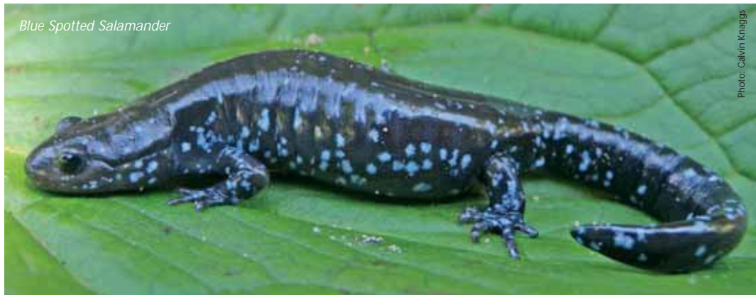
Blue Spotted Salamander