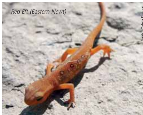
Red Eft (Eastern Newt)