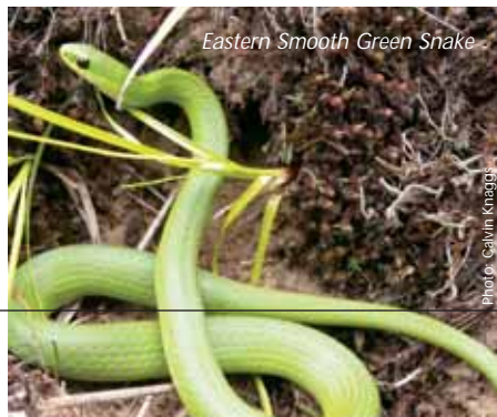
Eastern Smooth Green Snake