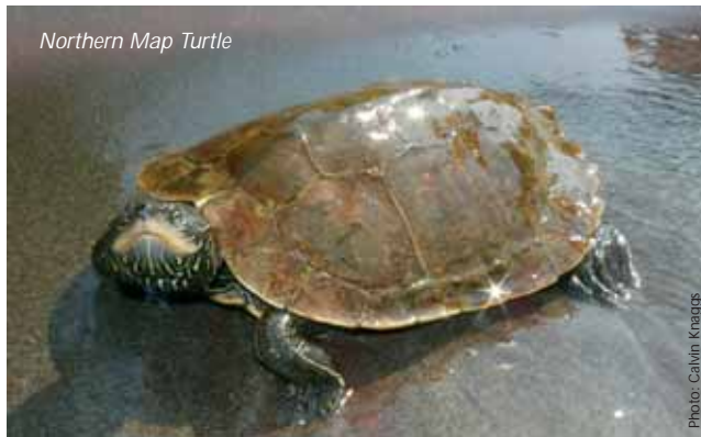
Northern Map Turtle