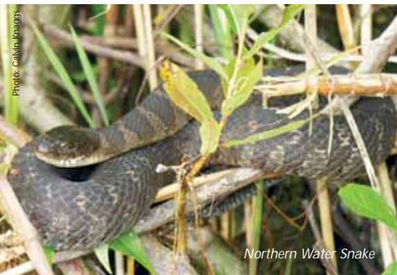
Northern Water Snake