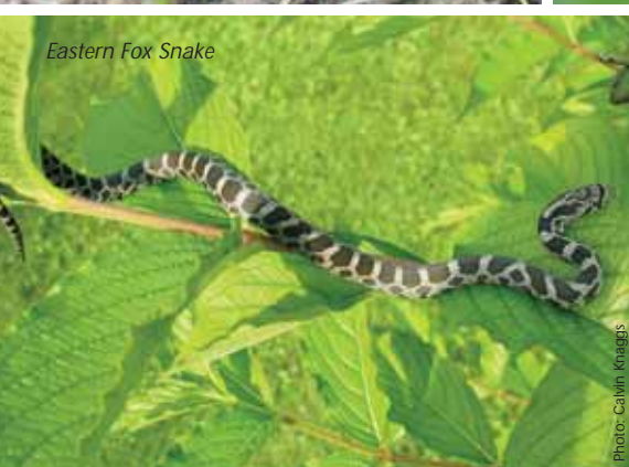
Eastern Fox Snake