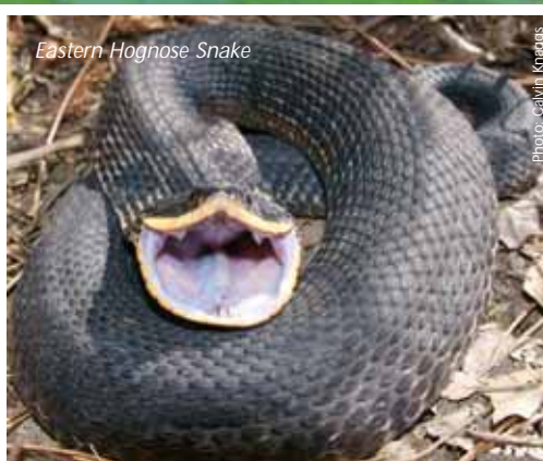
Eastern Hoghose Snake