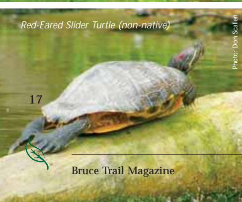
Red-Eared Slider Turtle (non-native)