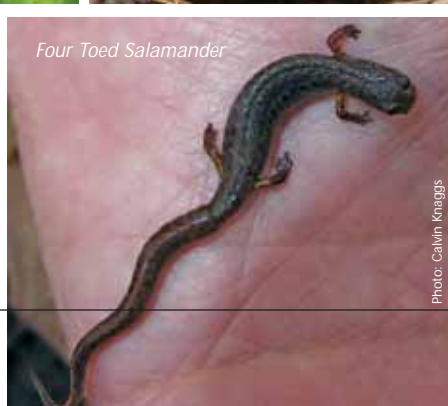
Four Toed Salamander