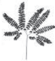
MAIDENHAIR FERN ( Adiantum pedatum )