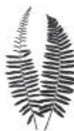
CHRISTMAS FERN ( Polystichum acrostichoides )