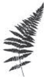
HAY SCENTED FERN ( Dennstaedtia punctiloga )