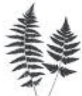
CRESTED SHIELD FERN ( Dryopteris cristata )