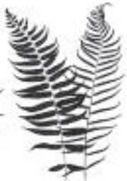
NARROW LEAVED GLADE FERN ( Diplazium pycnocarpon )