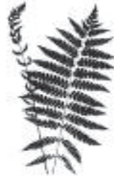
CINNAMON FERN ( Osmunda cinnamomea )