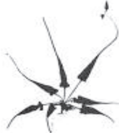
WALKING FERN ( Asplenium rhizophyllum )