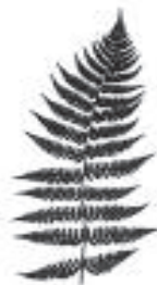
( Dryopteris marginalis )