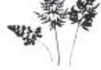
SLENDER CLIFFBRAKE ( Onoclea sensibilis )