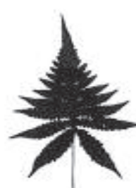
NORTHERN BEECH FERN ( Phegopteris connectilis )