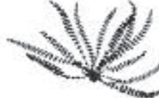
MAIDENHAIR SPLEENWORT ( Asplenium trichomanes )