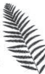
CHAIN FERN ( Woodwardia virginica )