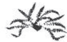
GREEN SPLEENWORT ( Asplenium trichomanes-ramosum )