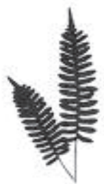
COMMON POLYPODY ( Polypodium virginianum )