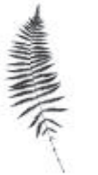
NEW YORK FERN ( Thelypteris noveboracensis )