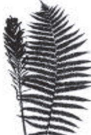
OSTRICH FERN ( Mettenia struthiopteris )