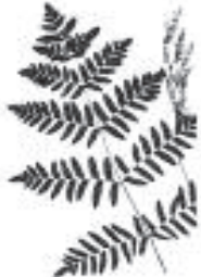
ROYAL FERN ( Osmunda regalis )