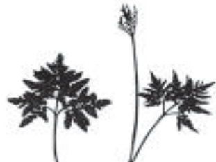
DISSECTED GRAPE FERN ( Botrychium dissectum )