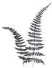
BULBLET FERN ( Cystopteris bulbifera )