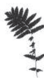
INTERRUPTED FERN ( Osmunda claytoniana )