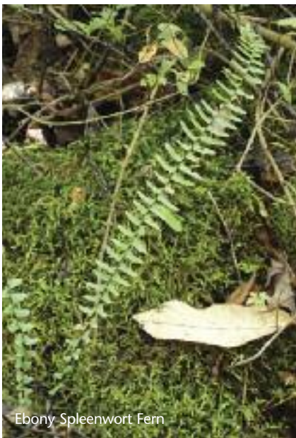
Ebony Spleenwort Fern

brown. The closely related, but uncommon, Green Spleenwort has bright green stems and it is most often spotted in deep crevices or on extremely shaded rock walls. Ebony Spleenwort is much larger and extremely rare, but it has been