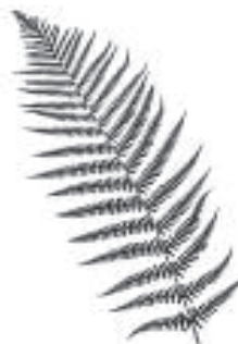
MALE FERN ( Dryopteris filix-mas )