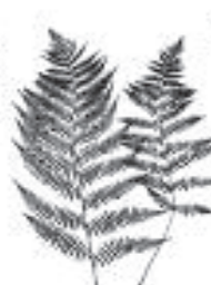
LADY FERN ( Athyrium filix-femina )