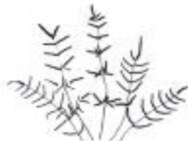
PURPLE-STEMMED CLIFFBRAKE ( Pellaea atropurpurea )