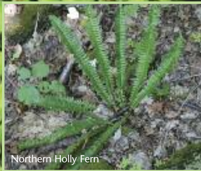
Northern Holly Fern