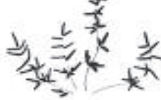
SMOOTH CLIFFBRAKE FERN ( Pellaea glabella )