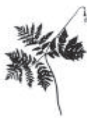
RATTLESNAKE FERN ( Botrychium virginianum )