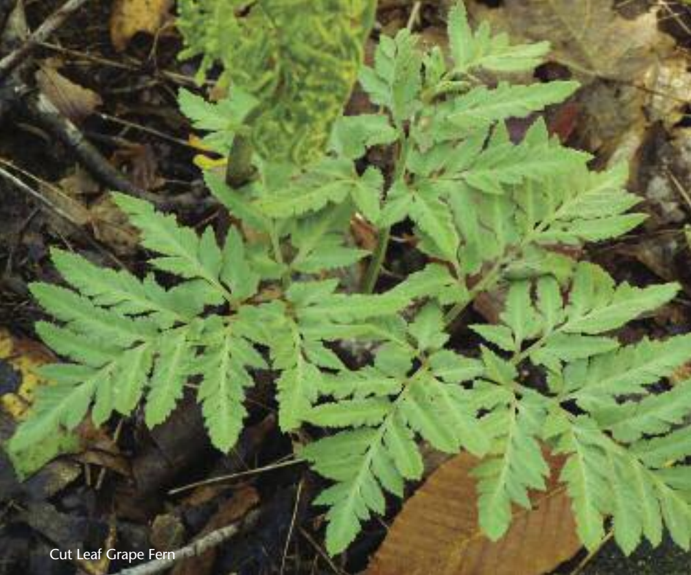
Cut Leaf Grape Fern

Bruce Peninsula and on Flowerpot Island, which is an extension of the Escarpment.