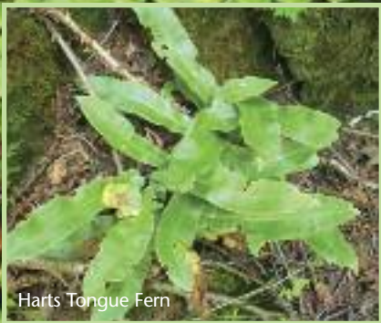
Harts Tongue Fern