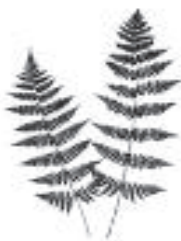
COMMON WOOD FERN ( Dryopteris carthusiana ) ( Dryopteris intermedia )