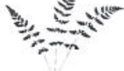
FRAGILE FERN ( Cystopteris fragilis )