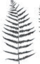
SILVERY GLADE FERN ( Deparia acrostichoides )