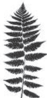
GOLDIE'S FERN ( Dryopteris goldiana )