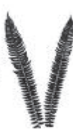
NORTHERN HOLLY FERN ( Polystichum lonchitis )