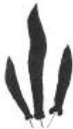
HART'S TONGUE FERN ( Asplenium scolopendrium )