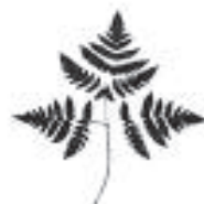
OAK FERN ( Gymnocarpium dryopteris )