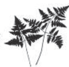
ROBERT'S FERN ( Gymnocarpium robertianum )