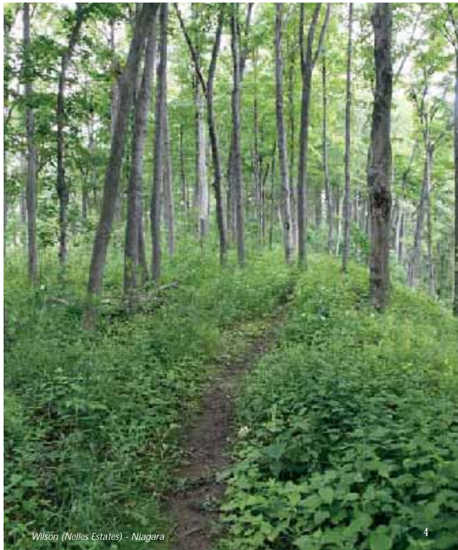
Wilson (Nelles Estates) - Niagara