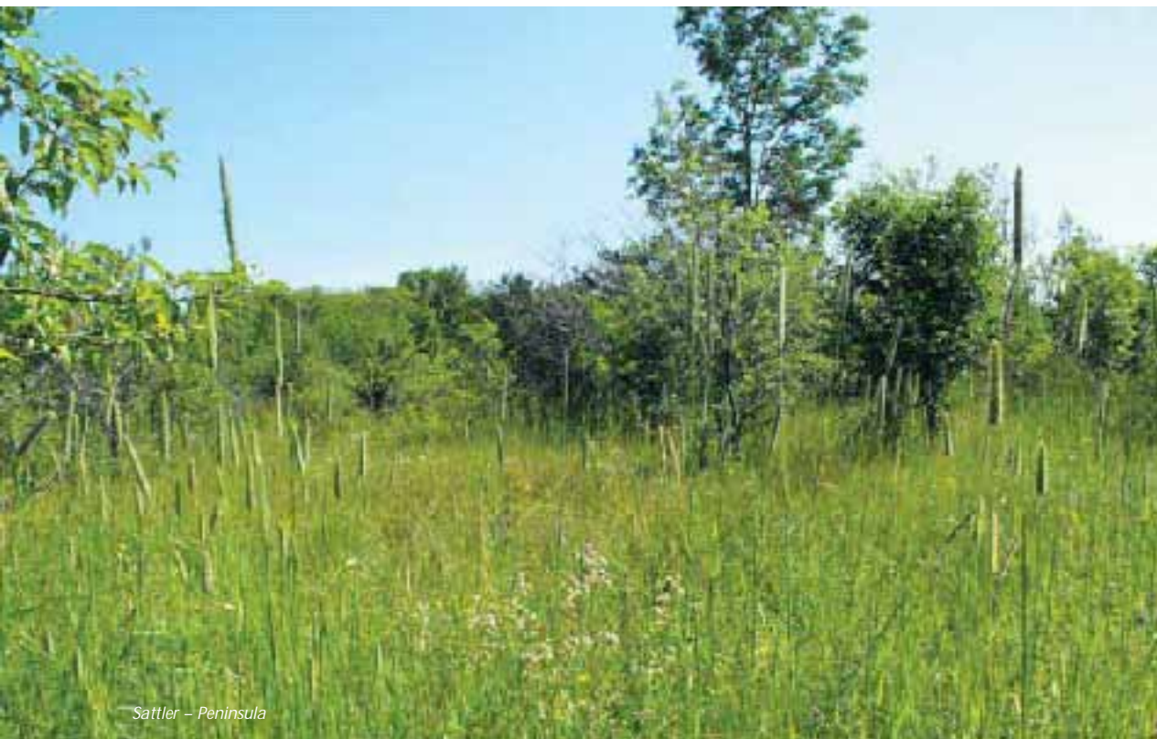
Sattler - Peninsula