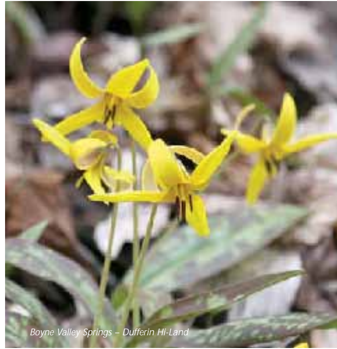
Boyne Valley Springs - Dufferin Hi-Land