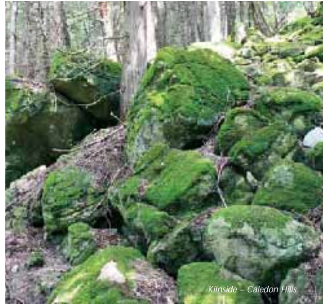
Kilnside - Caledon Hills

0.03 ha (0.08 acres) preserved; 13 m of Bruce Trail Optimum Route secured. Funded by BTC donors.