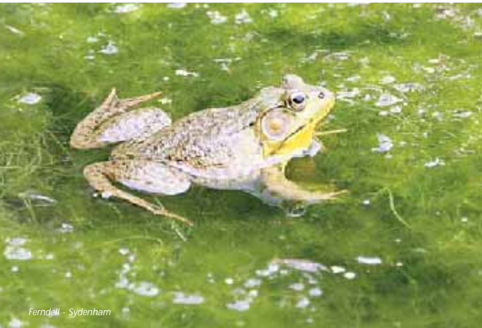
Ferndell - Sydenham