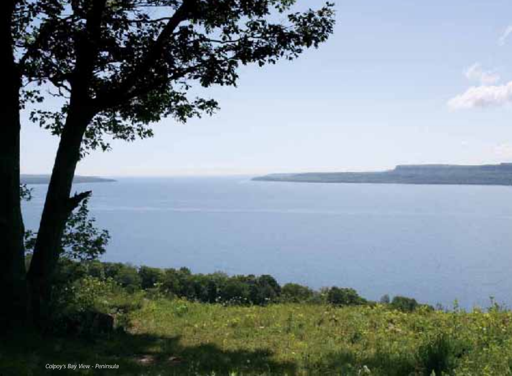
Colpoy's Bay View - Peninsula