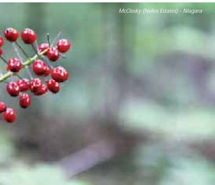
McClosky (Nelles Estates) - Niagara

0.17 ha (0.42 acres) preserved; 23 m of Bruce Trail Optimum Route secured. Generously donated by the landowner.