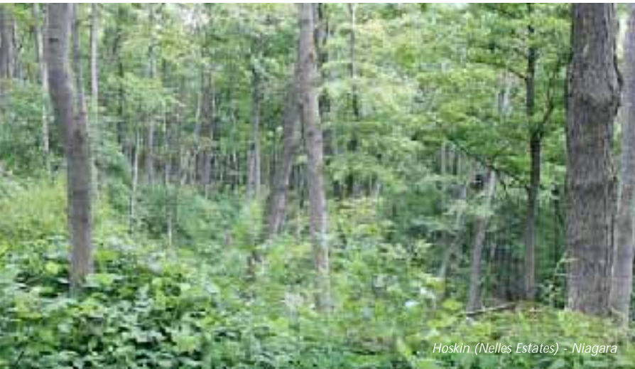
Hoskin (Nelles Estates) - Niagara

In the 2008-2009 fiscal year The Bruce Trail Conservancy secured 17 properties through our land acquisition program, the most we've ever secured in a single year. These acquisitions allowed us to preserve 221 hectares (547 acres) of Escarpment land and secure 7.3 km of Bruce Trail Optimum Route.