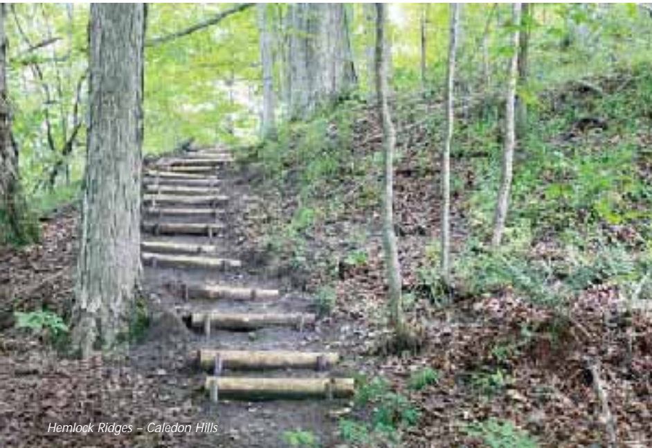
Hemlock Ridges - Caledon Hills

32 ha (79 acres) preserved; 1,120 m of Bruce Trail Optimum Route secured. Property purchase funded by BTC donors including the landowners. Ancillary purchase costs funded by a grant from the Ontario Land Trust Assistance Program.