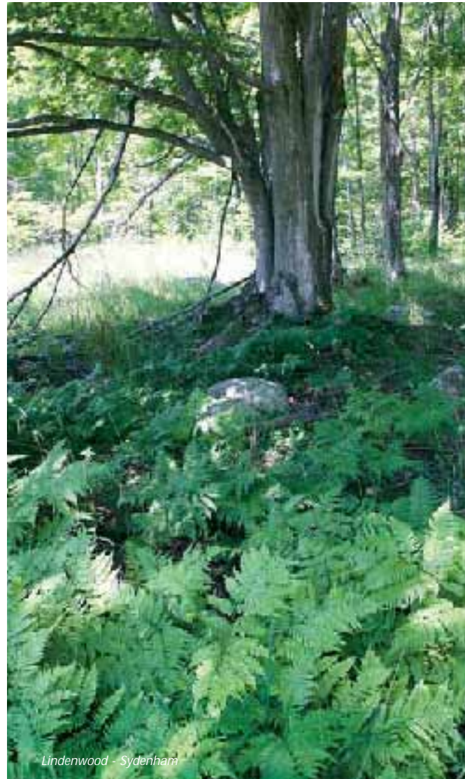
Lindenwood - Sydenham