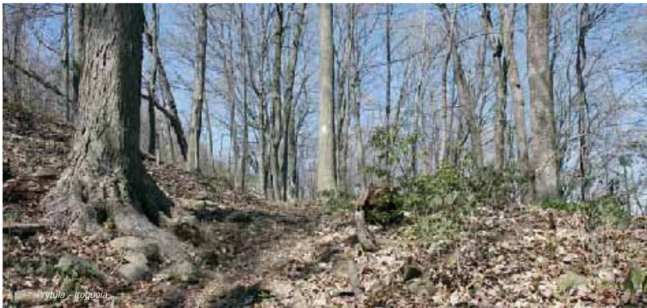
Prytula - Iroquoia