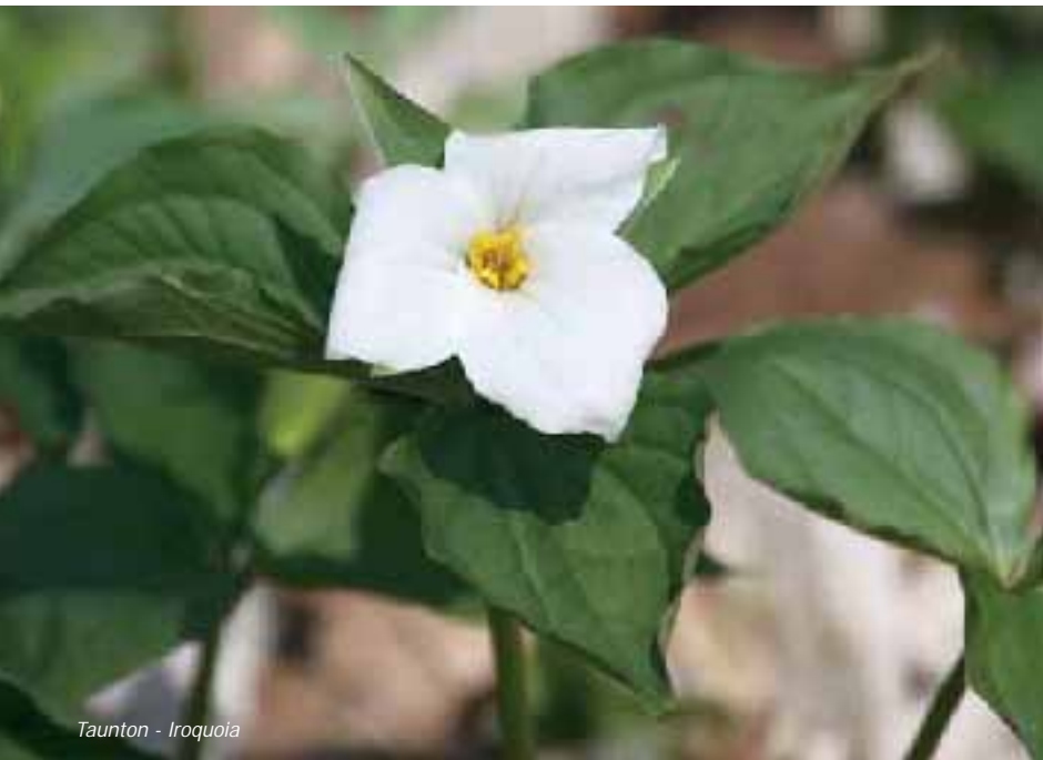
Taunton - Iroquoia

0.81 ha (2.0 acres) preserved; 113 m of Bruce Trail Optimum Route secured. Generously donated by the landowner.