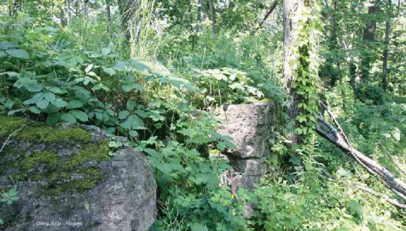
Cherry Ridge - Niagara