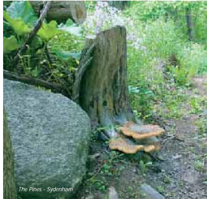
The Pines - Sydenham

35 ha (87 acres) preserved; 547 m of Bruce Trail Optimum Route secured. Funded by BTC donors.