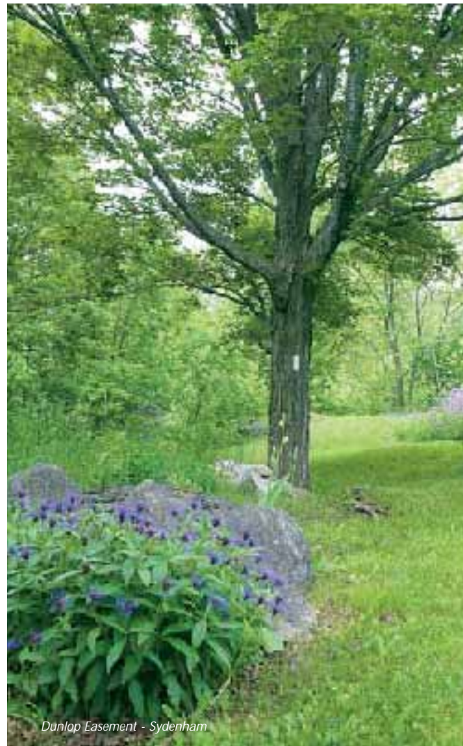
Dunlop Easement - Sydenham