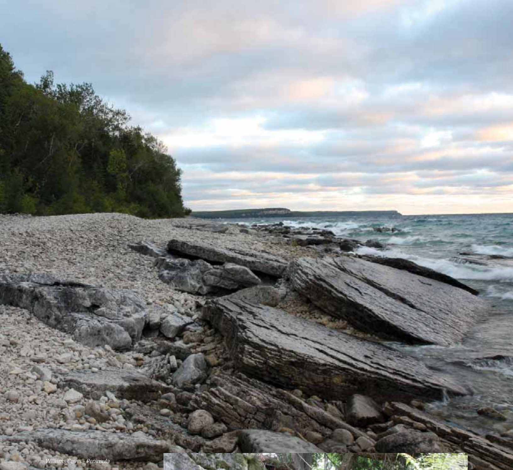
Williams Caves - Peninsula