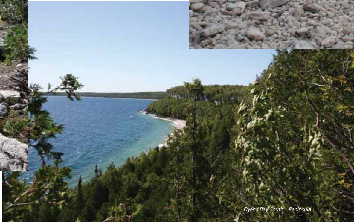
Dyer's Bay South - Peninsula