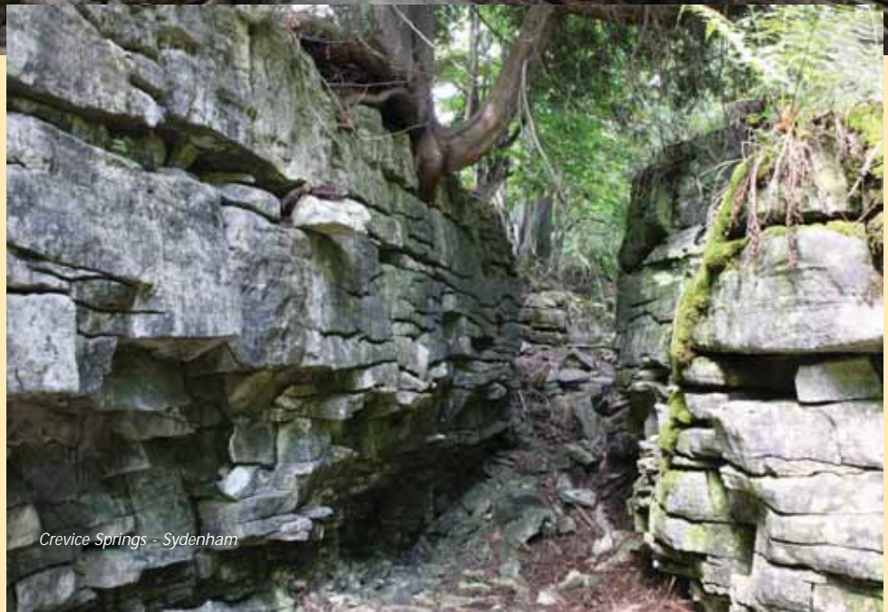
Crevice Springs - Sydenham