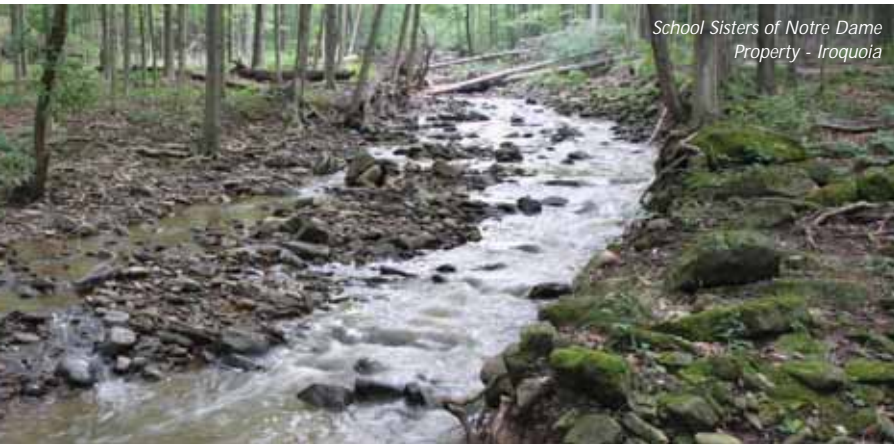
School Sisters of Notre Dame Property - Iroquoia

During this fiscal year we preserved a record breaking 15 properties through our land acquisition program, amounting to 330 hectares (815 acres) of Escarpment landscape protected forever and securement of 11.6 km of Bruce Trail Optimum Route.