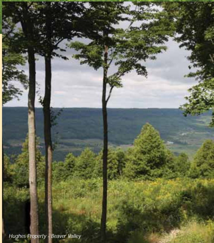
Hughes Property - Beaver Valley

17 ha (41 acres) preserved; 841 m of Bruce Trail Optimum Route secured. Funded by BTC donors. The BTC plans to transfer title of the property’s conservation lands to the Ontario Heritage Trust (OHT) under the Natural Spaces Land Acquisition and Stewardship Program, which will reimburse 50% of the purchase price.