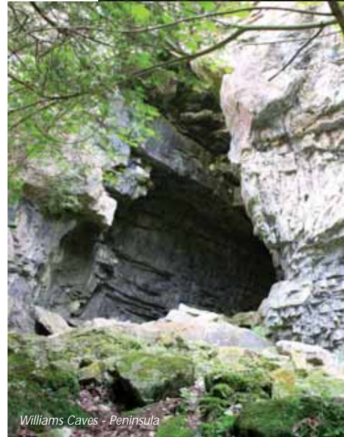
Williams Caves - Peninsula

Dyer's Bay North: 3.4 ha (8.4 acres) preserved; 400 m of Bruce Trail Optimum Route secured. Dyer's Bay South: 1.4 ha (3.4 acres) preserved; 117 m of Bruce Trail Optimum Route secured. Property purchase funded by BTC donors. Ancillary purchase costs funded by a grant from the Ontario Land Trust Assistance Program.