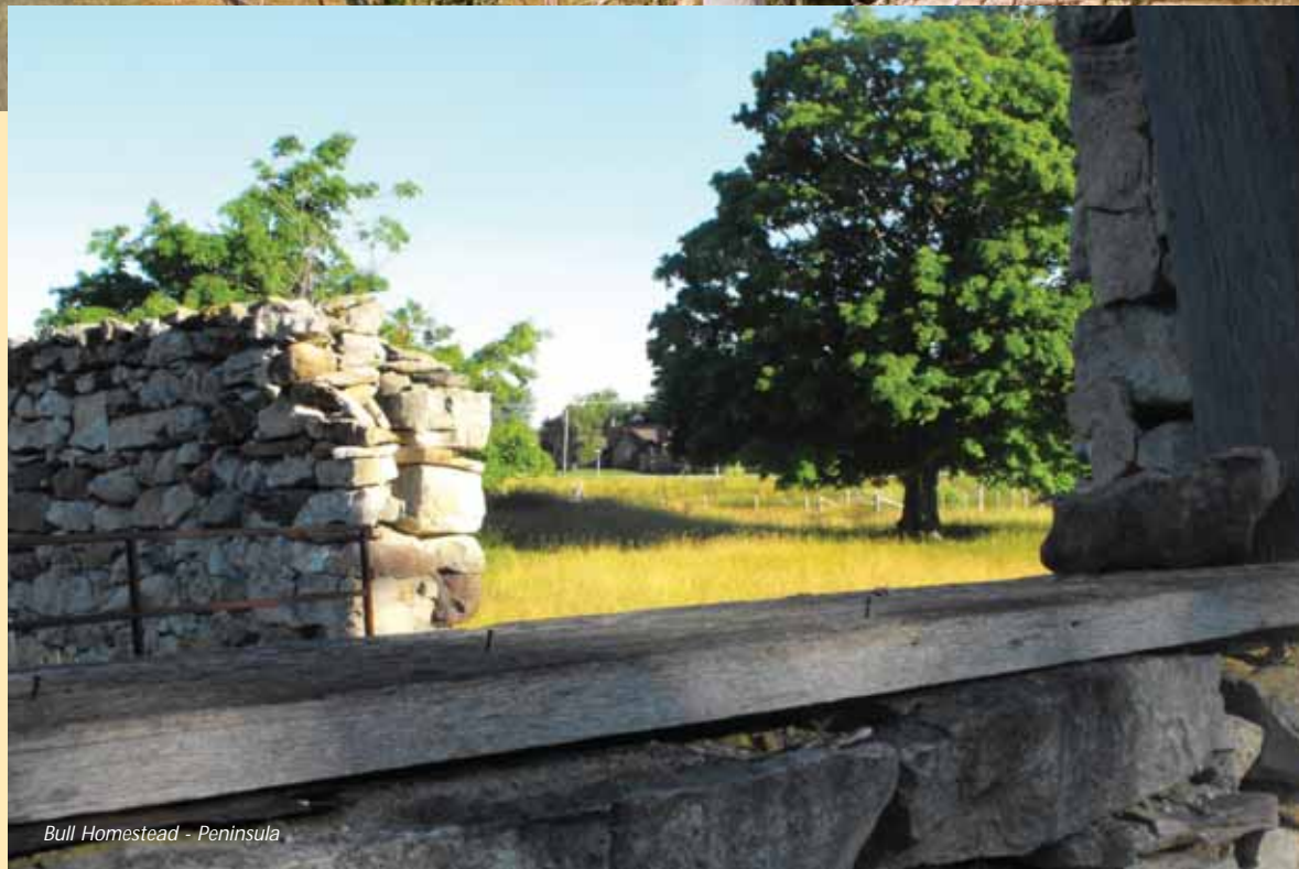
Bull Homestead - Peninsula