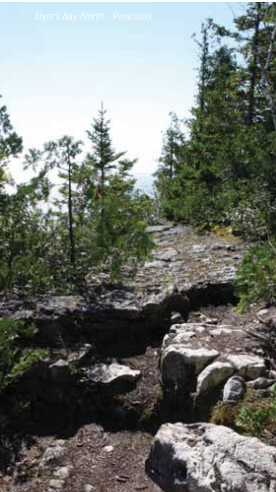
Dyer's Bay North - Peninsula