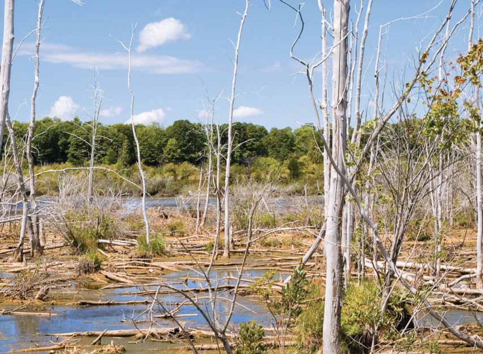
Malcolm Bluff Wetland - Peninsula