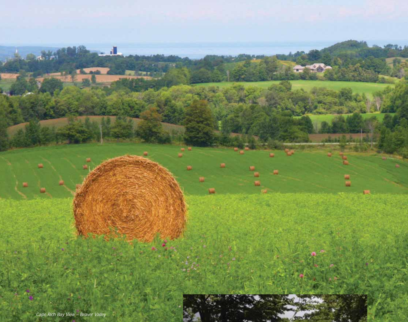
Cape Rich Bay View – Beaver Valley