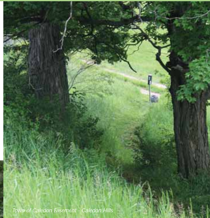
Town of Caledon Easement - Caledon Hills

0.8 ha (2 acres) preserved; 1,660 m of Bruce Trail secured. Donated by the Town of Caledon.