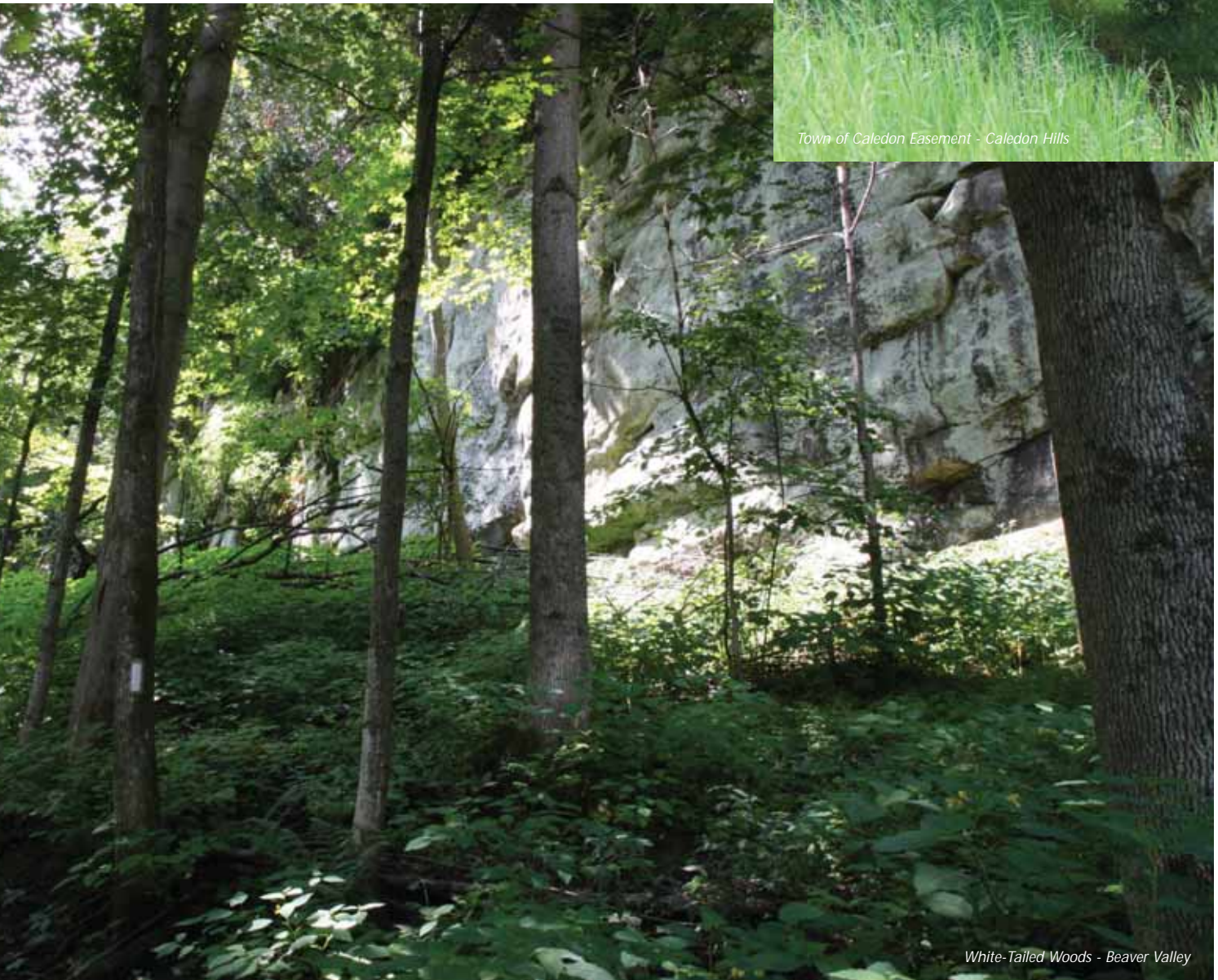
White-Tailed Woods - Beaver Valley