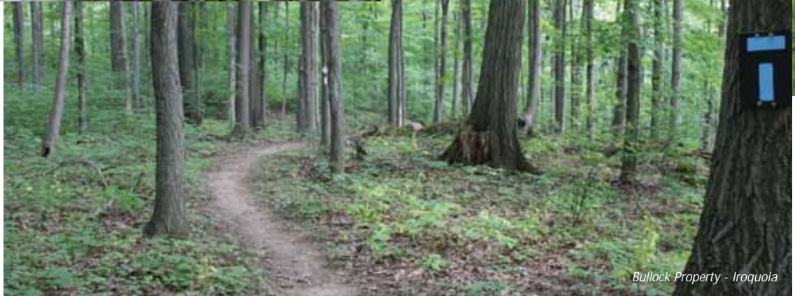
Bullock Property - Iroquoia

Bullock Property - Iroquoia 0.8 ha (2 acres) preserved; 217 m of Bruce Trail Optimum Route secured. Funded by BTC donors.