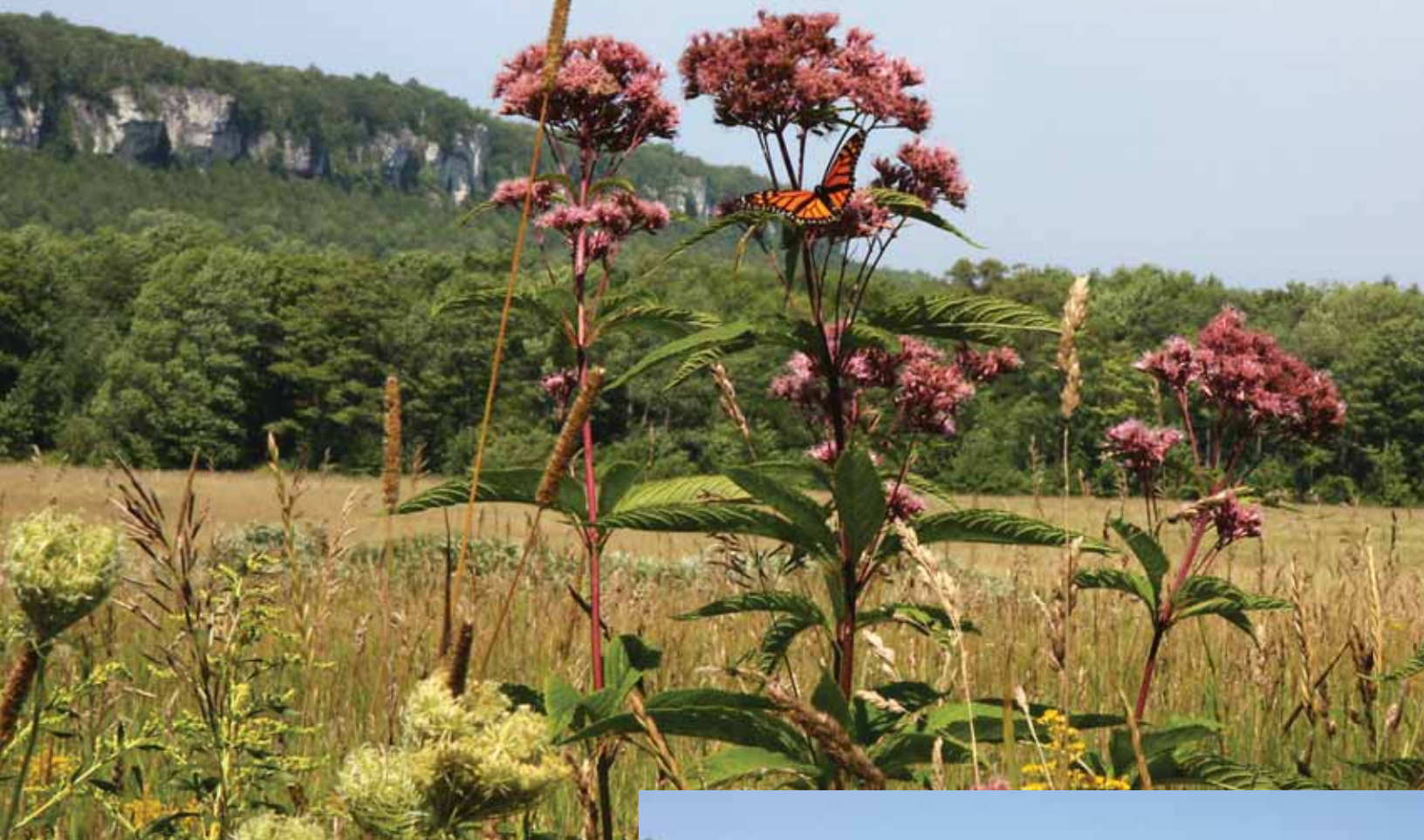
Boundary Bluffs, Burt Property - Peninsula